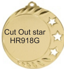
Cut Out star HR918G